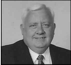
Illinois Police Association Official Journal February 2012 Issue