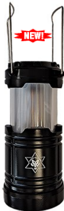
The Illinois Police Association Lantern imprinted with the white IPA Star Logo.

ALL IPA Merchandise is available online @ www.ipastore.com