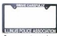
Car or motorcycle license plate holder $5.00