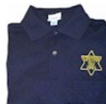
Golf shirts: black, white, and red. Call for available Size and pricing