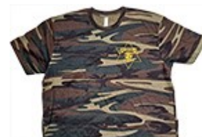
Camouflage T-Shirt with IPA Star Logo Call for available Size and pricing

NOTE: If ordering more than one product please use the reverse side to list each additional item as shown below.