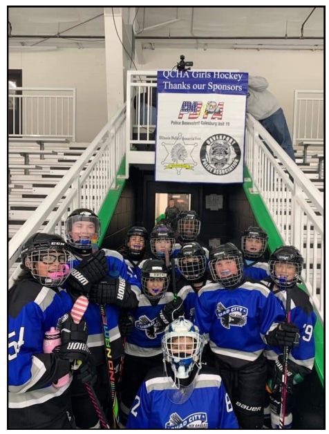
Quad City Girls Ice Hockey Team that the Blackhawk Division Sponsors showing the banner with the IPA Blackhawk Division