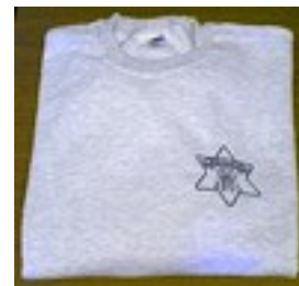
Sweatshirt: grey, navy and black Call for available Size, Color