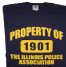
Property of IPA 1901 T-shirts: black, gray, navy blue Call for available Size and pricing