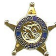
Lapel Pin $5

NOTE: If ordering more than one product please use the reverse side to list each additional item as shown below or call the office with a credit card.